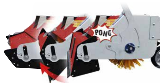
With a deflection angle of more than 90° the standard collecting box becomes completely emptied without residues.