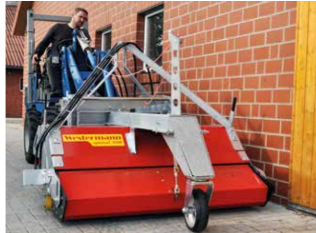
The high maneuverability of the sweeper allows safe maneuvering even near the wall.