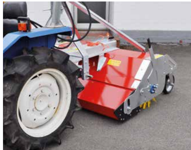
Attaching sweeper suitable for various carrying vehicles.