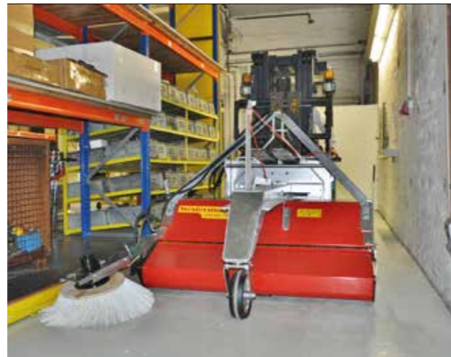
An additional optionally available side brush ensures cleanliness right up to the edges.